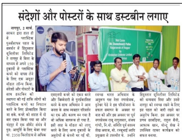
Binner covered in Dainik Bhaskar, Nagpur

BDI's new social venture Binner, aims to solve a leading global problem of plastic waste. Binner team helps corporates comply with the regulations of Extended Producers' Responsibility (EPR) by collecting the plastic waste from the market for responsible disposal/ recycling. Binner also motivates and incentivizes citizens and brings them onboard for Extended Citizens' Responsibility (ECR).